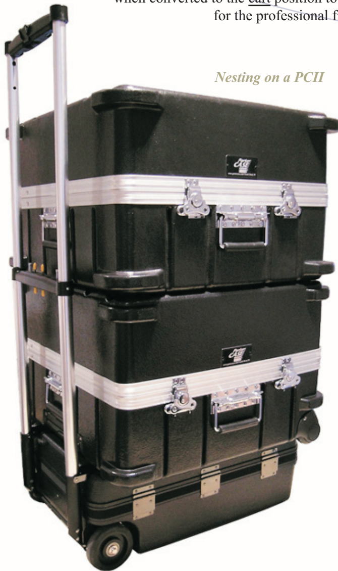
Nesting on a PCII

Up to 3 Stowaway 20-20 cases will nest on top of a Porter Case PC II or Elite model when converted to the cart position to form a complete "travel system" for the professional frequent traveler.