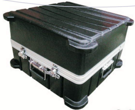
(WLF) Wheel & handle option