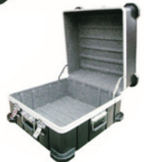
Optional interior divider